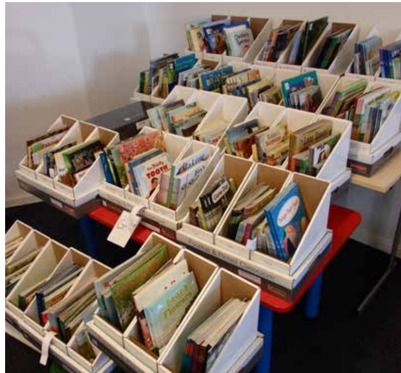
Classrooms from K to PYP 4 are being provided with a brand new classroom library. PYP5 classrooms will receive their books next year when additional readers on grade 5 level are released by the publisher.

Fountas and Pinnell's selection of books and teachings are based in the research practice that when a text is too difficult for a child, he or she does not process it effectively. When the text poses enough challenge, but not too much, the child develops effective, problem-solving strategies. The goal of reading well implies reading with deep comprehension and gaining maximum insight or knowledge from each source. Engaging them and fueling their intellectual curiosity helps students become strong readers and life-long learners.