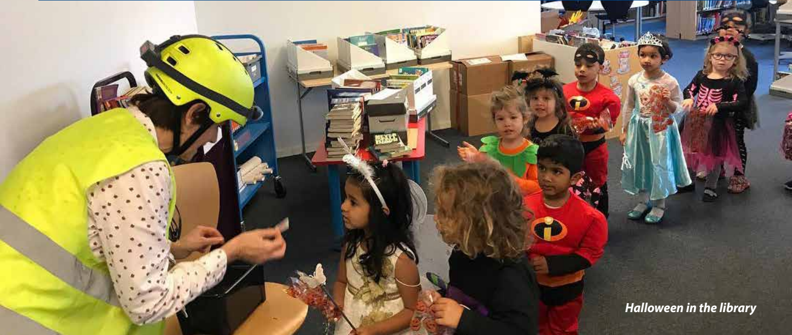
Halloween in the library

The latest news and updates from International School of Hellerup