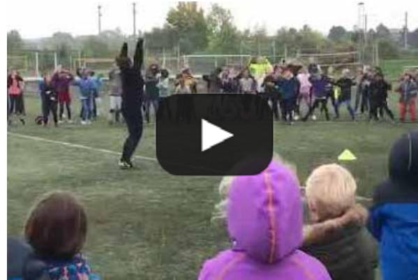
Video: PYP Motions Day warm-up session

On Friday 5th October, all PYP participated in a Motions Day at Ryparken. There was a 1k run/walk through the forest, and different team-building and fitness activities on the sports field. The rain did not stop the children from having a fun, healthy and active day!