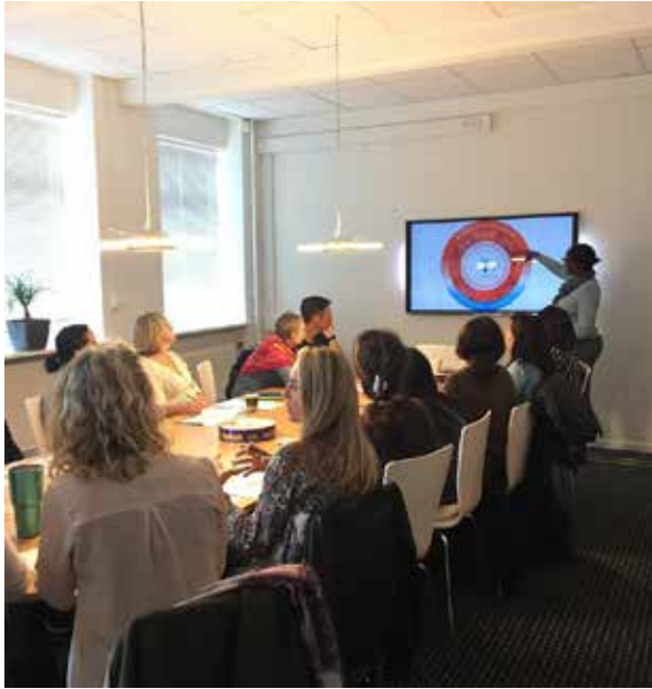
The MYP Coffee Morning on October 10th

It takes a village to raise successful IB students. As parents, partnering with school and staying connected to your child's education empowers you to support them.