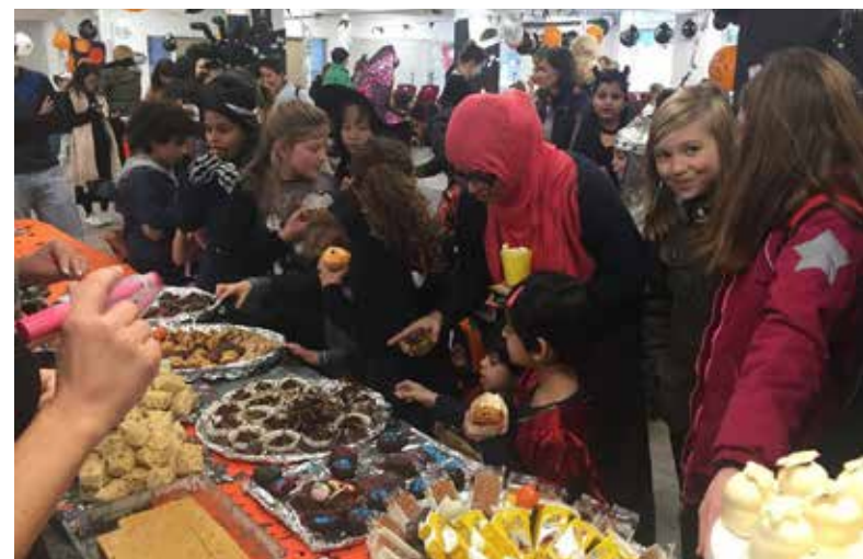
The PYP Halloween Party