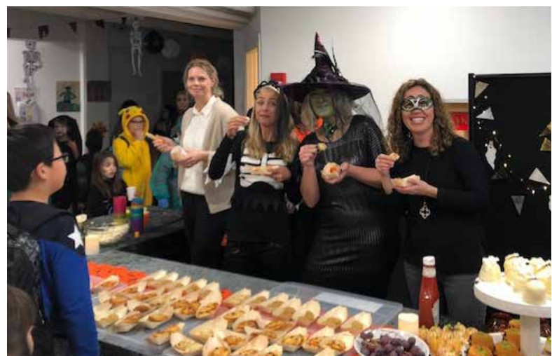
PTA at the PYP Halloween Party