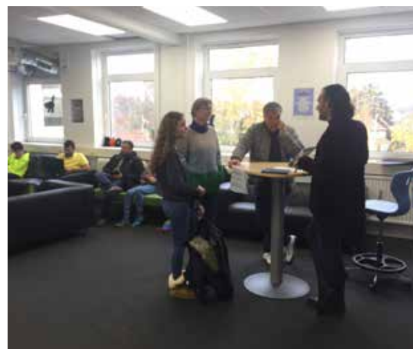
Secondary School Parent-Teacher Conferences