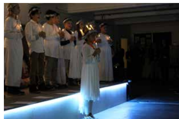
Photos from last year's Festival of Lights Performances