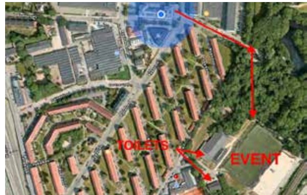
Ryparken idrætsanlæg is located near our school

We sincerely hope that the word will really spread that it is a great day and in the coming years this event is supported by all students and parents and more students are at school to enjoy the fun, build stronger friendships, and develop a great love of exercise.